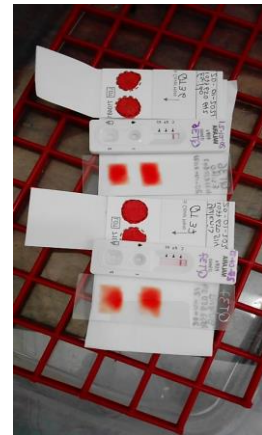
Samples taken for the study at the Tutunendo Health Center, Quibdó.