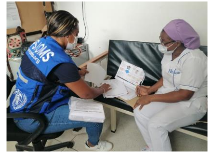
Supervision visit to the ESE Hospital Ismael Roldan Valencia.

Thanks to these results, the country can guide its interventions to expand the malaria diagnostic network based on the use of RDTs that detect the pfHRP2 gene, to access the most remote areas of the country and achieve timely access to quality diagnosis.