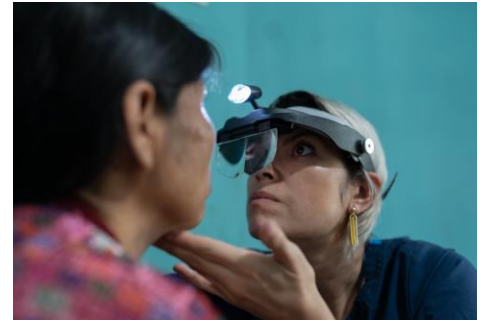
A woman affected by trichomatous trichiasis is being evaluated by an oculoplastic surgeon in Sololá, Guatemala, 2022.

Guatemala is the country in the Americas that is closest to eliminating trachoma as a public health problem. It is expected that surveys will soon be conducted to determine whether it has managed to reduce the prevalence of a) active infection in children aged 1 to 9 years to less than 5% and b) TT to less than 0.2% in persons aged 15 years and older, and c) to demonstrate that it can detect cases of trichiasis and operate them timely through its primary health care system.