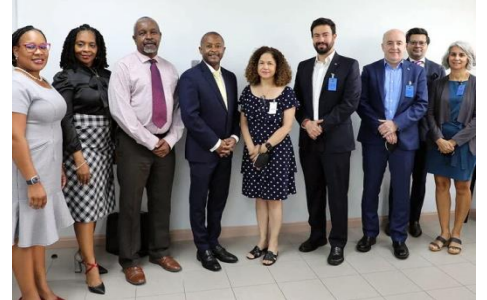
PAHO’s Evidence and Intelligence for Action in Health representatives visit Barbados to learn about the country’s digital transformation projects.

In Barbados, PAHO’s technical cooperation - always with USAID’s generous support - is strengthening information systems for Health throughout the country, a process that will ensure a sustainable implementation of the digital transformation of the health sector. National eGovernment initiatives, legislation and policy, financial sustainability, human resources, telehealth, data management and analysis capabilities, are all benefiting from this cooperation.