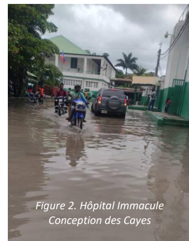
Figure 2. Hôpital Immacule Conception des Cayes