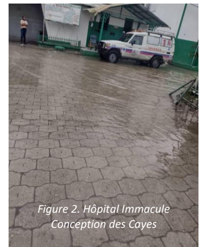
Figure 2. Hôpital Immaculé Conception des Cayes